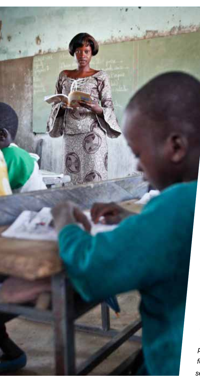
In Burkina Faso a local volunteer teacher helps to progress achievement of universal primary education.